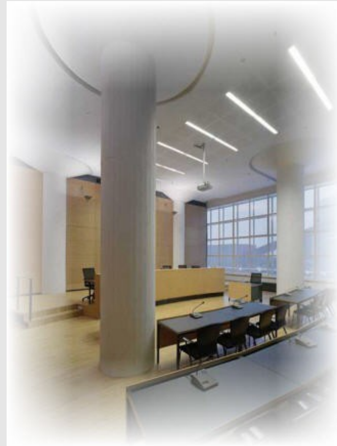
Helsinki District Court